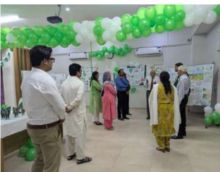
The Honorable Guests select the winning drawing