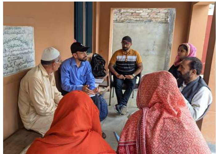
Members had a healthy discussion during the SMC Meeting