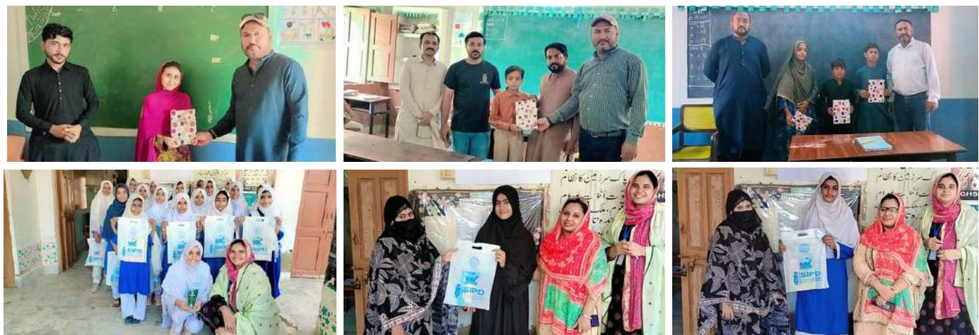
Award-winning students from various schools

My School Program Team distributed prizes among the winners of the art and drawing competitions. Students who secured 1st, 2nd, and 3rd positions were awarded prizes.