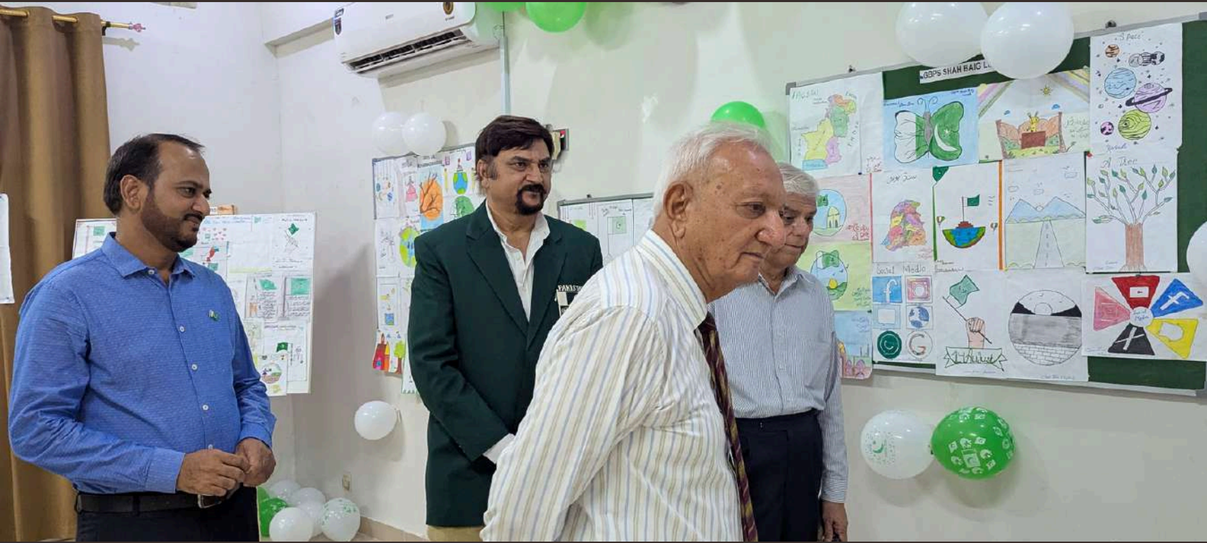
The distinguished guests appreciating and reviewing the artwork