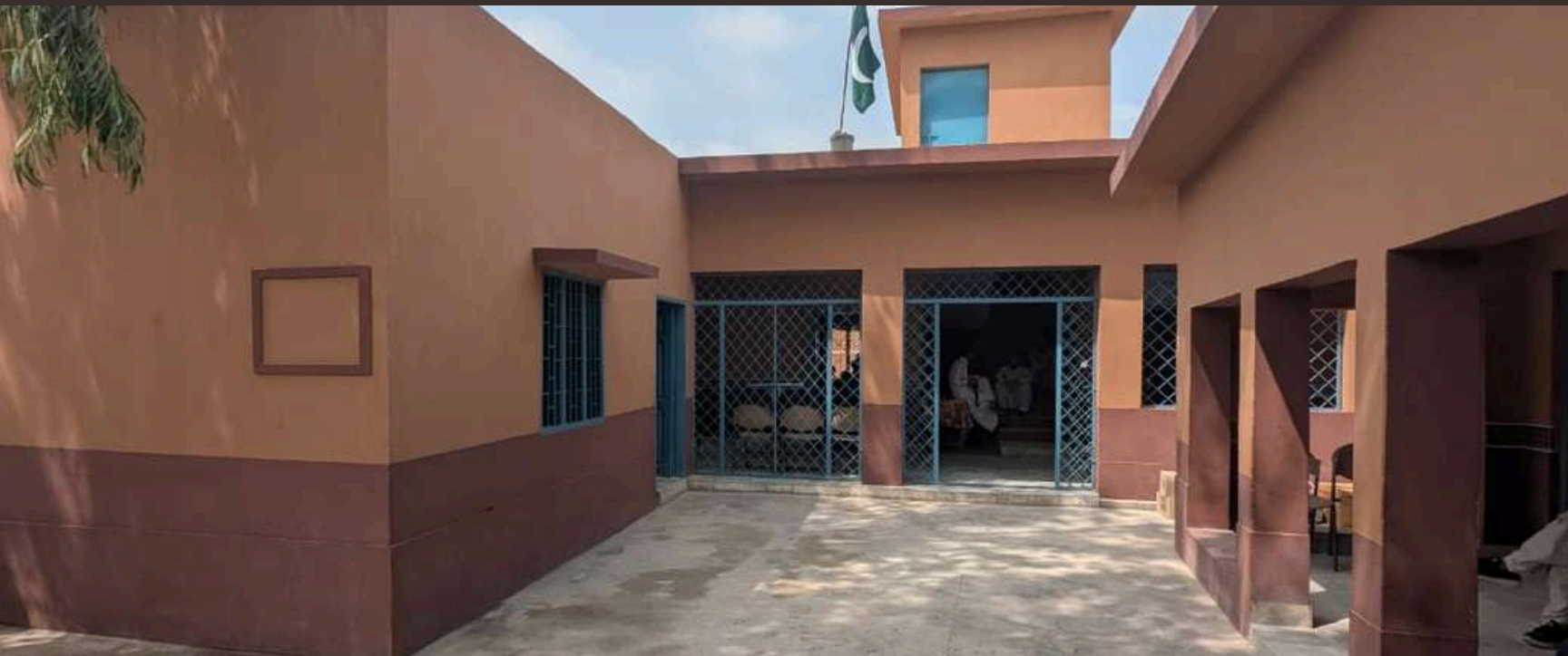
Completed Repairs at Government Girls Primary School, Piaro Lund