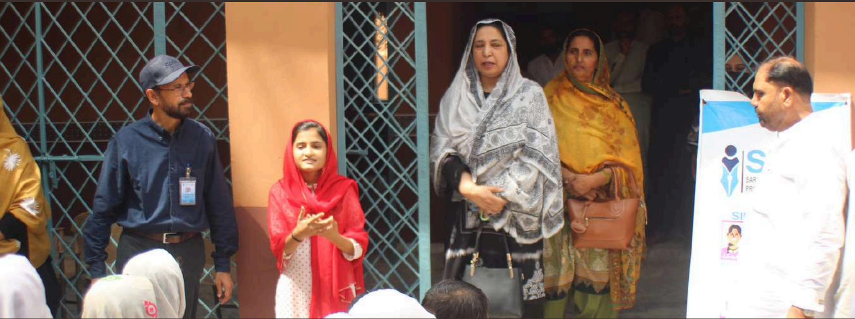
District Education Officer Secondary, the MSP Program Manager, and school staff during the celebrations