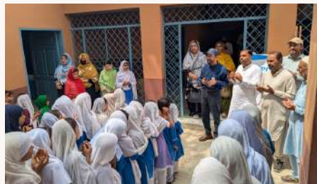
Dua moment was captured