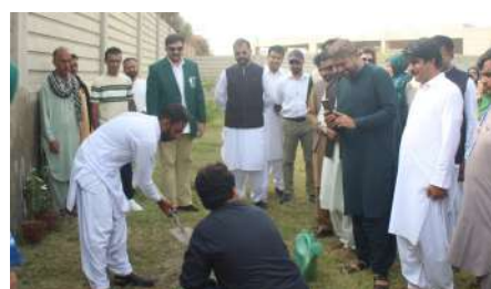
Batch 5 planted trees in the campus