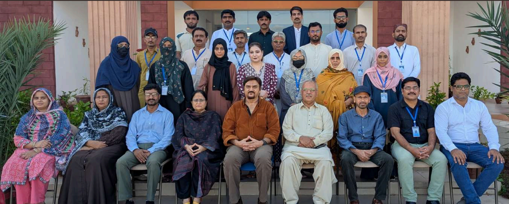
Leadership and Education Management Program Batch 8 with SIPD Team

SIPD expanded its successful Leadership and Education Management Program with three new batches in September and October. The program immersed participants in interactive learning from the initial orientation and tour through sessions rich with case studies, role-plays, and group work.