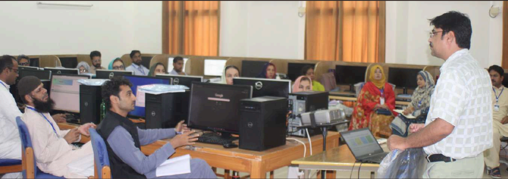
AI in Education Leadership and Management Program