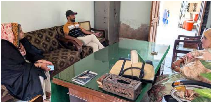
MSP Team met with the School Principal to discuss

In September 2025, an awareness session was conducted at GGHSS Main Sindhi Chamber at the Head Teacher's request. It focused on utilizing daily diaries for effective lesson planning and record-keeping. Teachers engaged in demonstrations and discussions, acquiring practical strategies to enhance their classroom management and instructional planning.