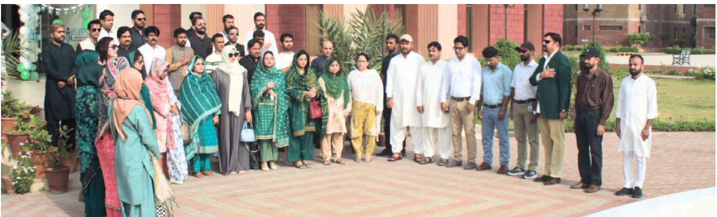
SIPD staff and Leadership Program Batch 5 participants celebrating Independence Day, 14 August 2025

On August 14, 2025, SIPD celebrated Independence Day with great enthusiasm. The event commenced with the national anthem and a special dua for the prosperity of the country.. Representatives from Batch 5 planted trees, symbolizing growth. The ceremony concluded with a communal breakfast for all staff and trainees.