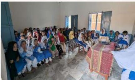
A quiet moment in the classroom