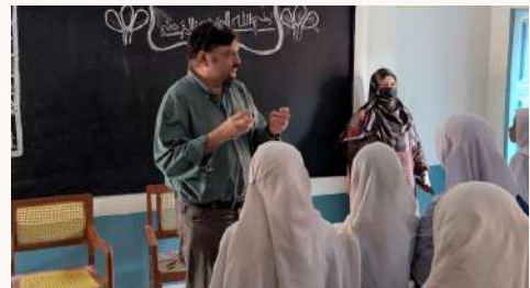
ED-SIPD listened to feedback from teachers and students