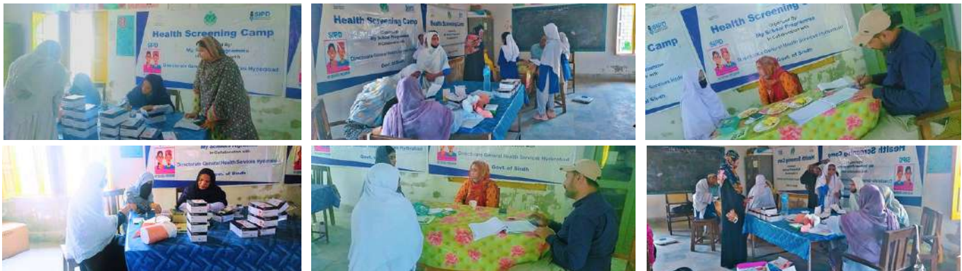
Glimpses of Health Screening Camp