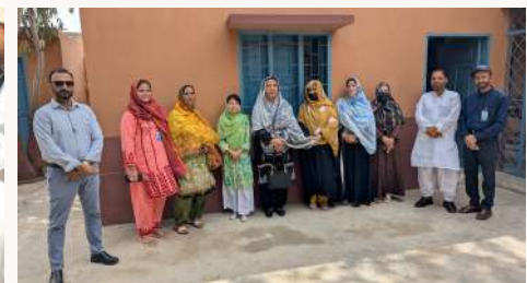
A wonderful moment shared with the DEO, staff, and MSP Team