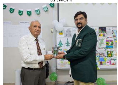
ED-SIPD presented a shield to the Honorable Guest