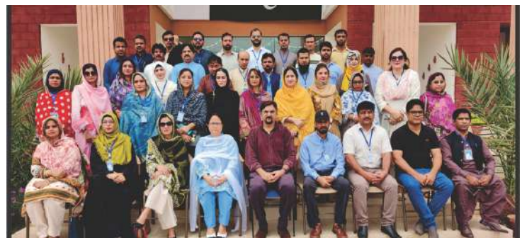
Leadership and Education Management Program Batch 5 with the SIPD team