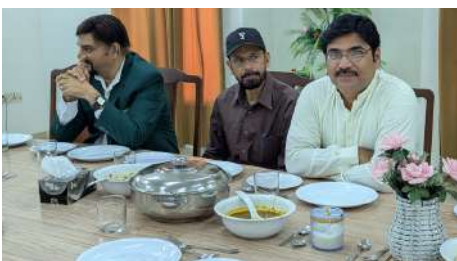
Breakfast with staff