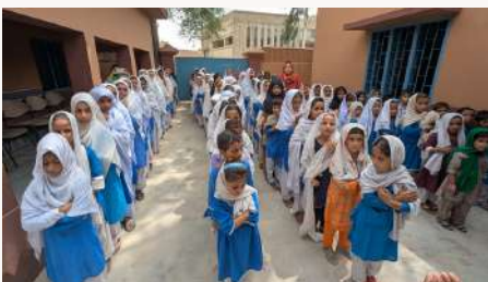
Refreshments served among students