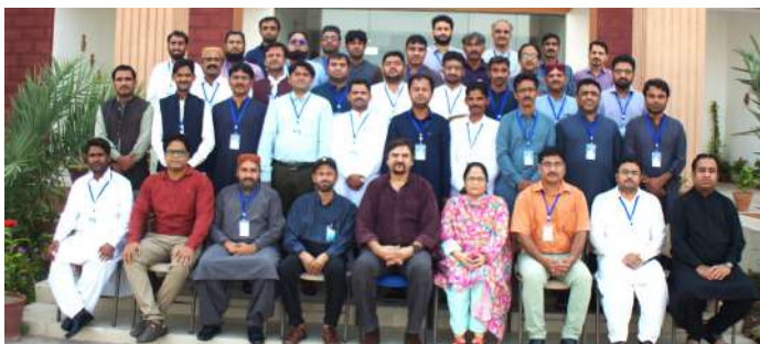
Leadership and Education Management Program Batch 6 with SIPD Team