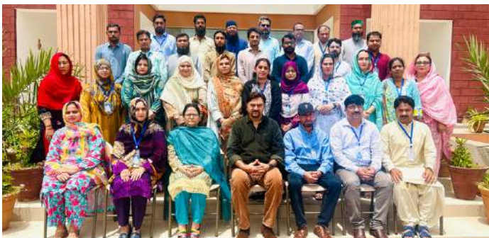
Leadership and Education Management Program Batch 4 with SIPD staff

Participants appreciated the quality of program and facilities. In their concluding reflections, they praised the course content, expert faculty, and supportive staff, with many expressing interest in future programs. Each batch concluded with closing remarks and a celebratory lunch, marking a profoundly successful and impactful professional development experience for all involved.