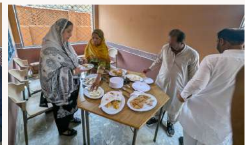
Refreshments served to the staff and guests