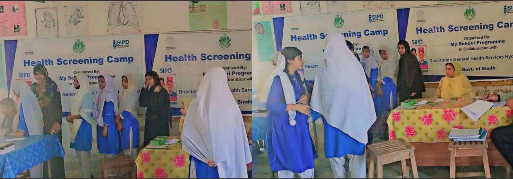
Health Screening at the Government Girls Higher Secondary School Chamber