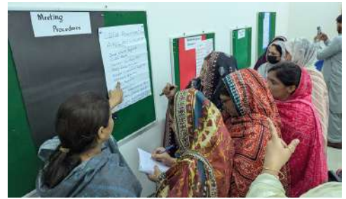
Gallery Walk Activity