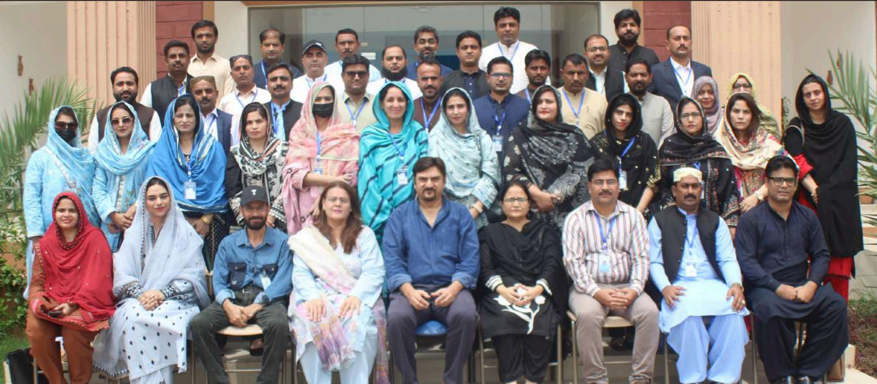
Leadership and Education Management Program Batch 3 with the SIPD staff