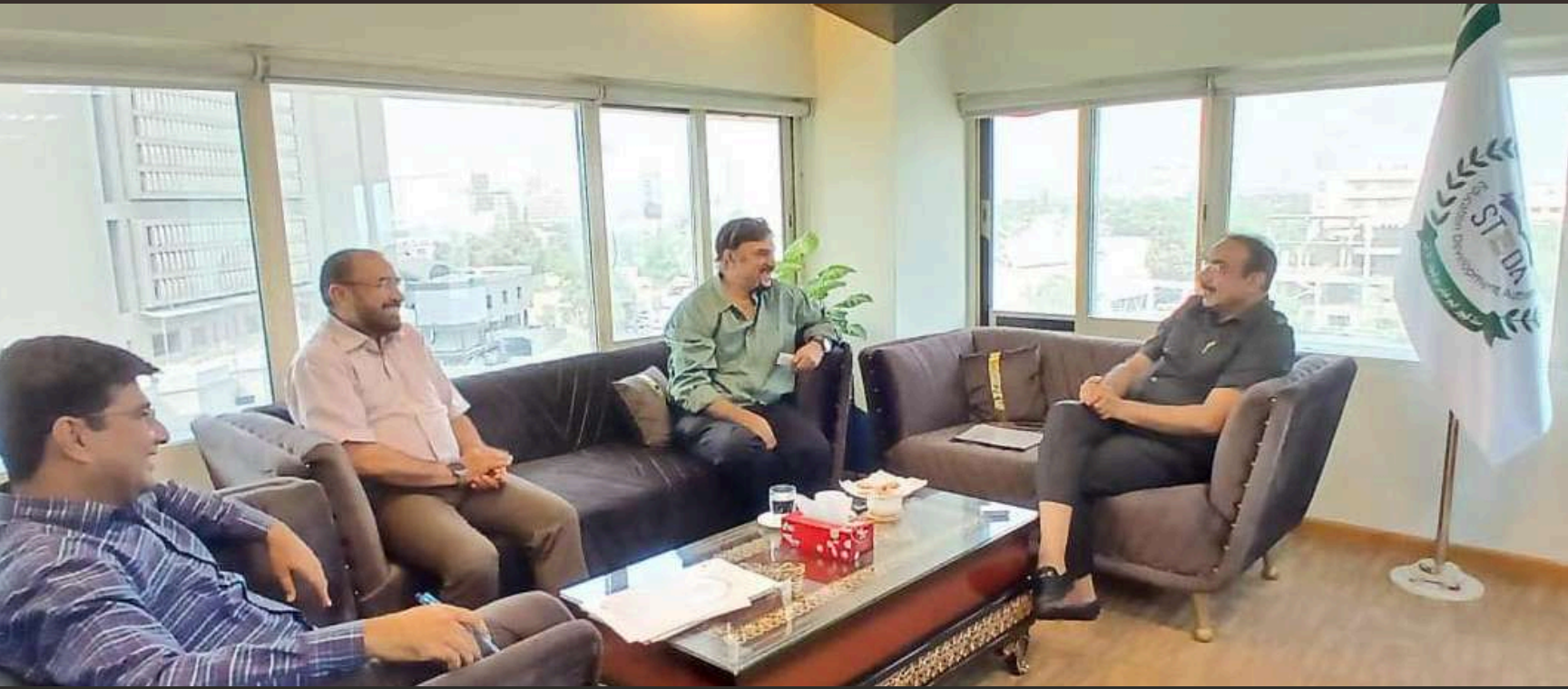
Meeting held at the STEDA Office