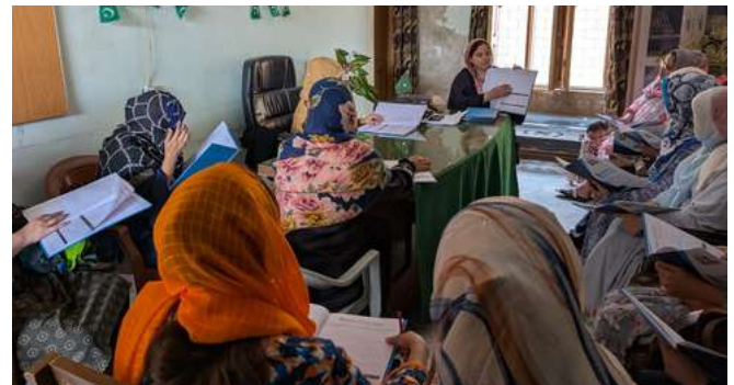
Session in progress, led by the MSP Team