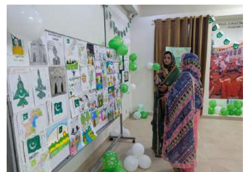
The Principal of TCF is reviewing the artwork