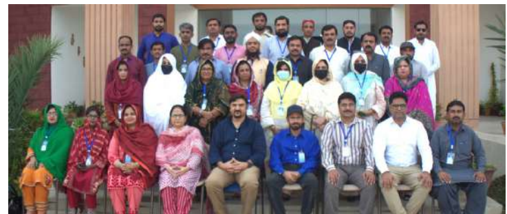
Leadership and Education Management Program Batch 7 with the SIPD team